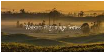
Waikato Pilgrimage Series