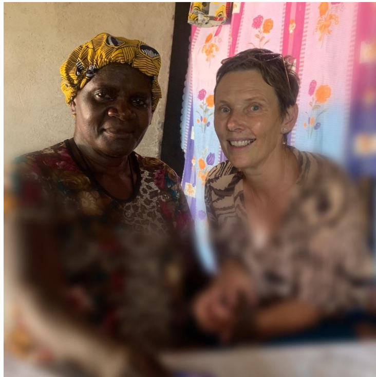
Delayed School Start