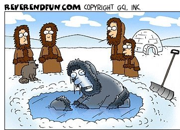
ANOTHER ESKIMO BAPTISM GONE BAD