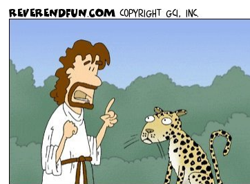
LEPERS ... I HEAL LEPERS

So... for those who might be new here today, we are in the midst of a seven week series. Last week, I painted a rather bleak picture of how we are viewed by those who are wary of Christian things. But that does not mean, that I am bleak about how we can respond. I am hugely optimistic, because I think the message of Jesus is hugely relevant to the questions and needs of the twenty first century, and so over these next three Sundays, we are going to look at three aspects of this message which we as a church can offer the World, with the first being, Grace, in my mind the most beautiful word in the English language.